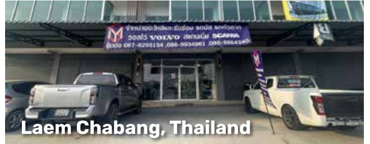
Laem Chabang, Thailand