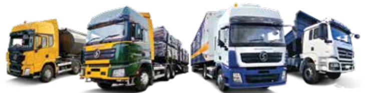
Prime Mover & Rigid Trucks

As an authorised distributor of Shacman trucks in Malaysia, we promote and sell the Prime Mover and Optimized X Series, which are the top of the line in their class, with better fuel efficiency, higher horsepower, and a safer cabin. With a total of 22 service centres and over 20 breakdown assistance branches across Malaysia, we offer excellent after-sales service for repair and maintenance. In addition, our 24-hour Breakdown Res-Q Team and hotline phone call covering all of Malaysia will offer peace of mind to every Shacman owner.