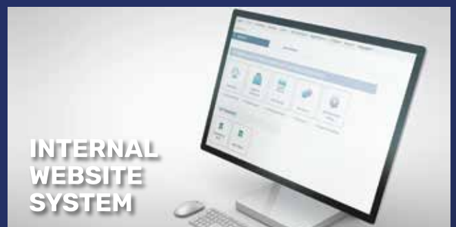
INTERNAL WEBSITE SYSTEM

We operate efficiently with our fleet of over 60 delivery vehicles. Local deliveries can be completed within the same working day of the order's placement.