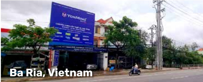
Ba Ria, Vietnam

Within the same year, we increased our global footprint by opening three additional international locations to serve a wider variety of customers.