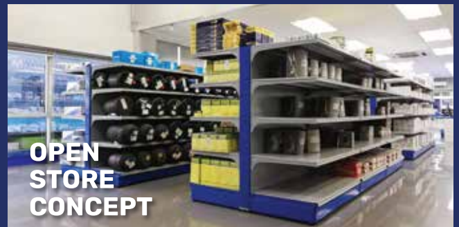
OPEN STORE CONCEPT

Over 20 Res-Q Team vehicles are in operation to expand the boundaries of services. Offering full equipment repair with just a phone call.